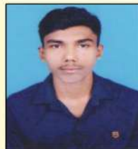
Bishal Barai Electrical - (2018 -21) Tata Motors Ltd.