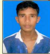
Sk. Soydul Mechanical - (2019 -22) Sarada Motors